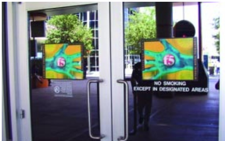
Entrance Doors- Window Decals