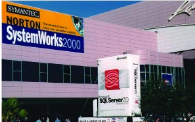
Inflatable and Magnetic Banners — Front Courtyard