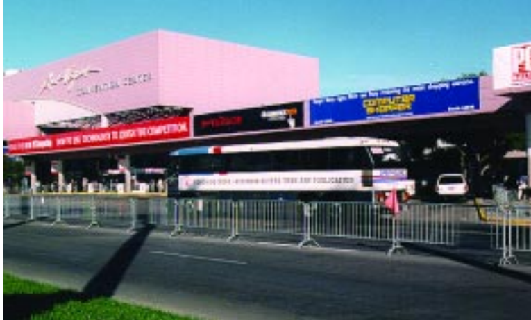
Hanging Banners — Bus Drop-Off Area