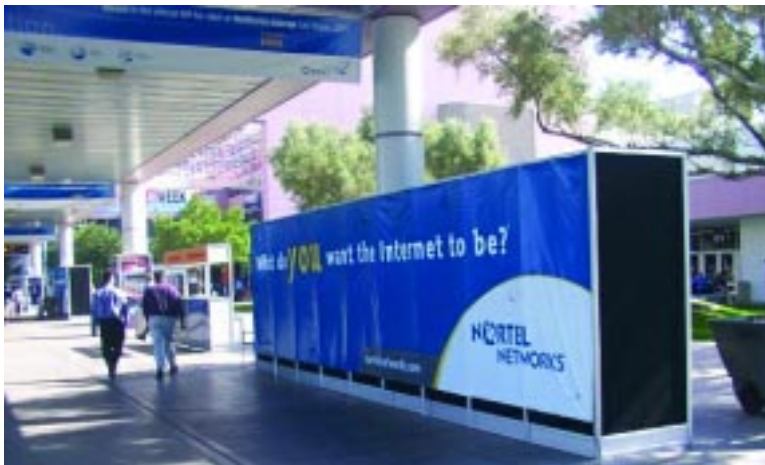
Outside Advertising Wall