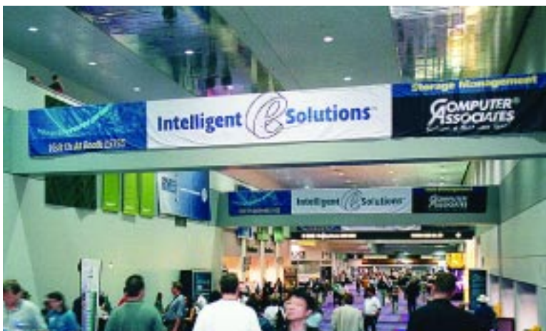
Hanging Banners Over Beams — Main Concourse