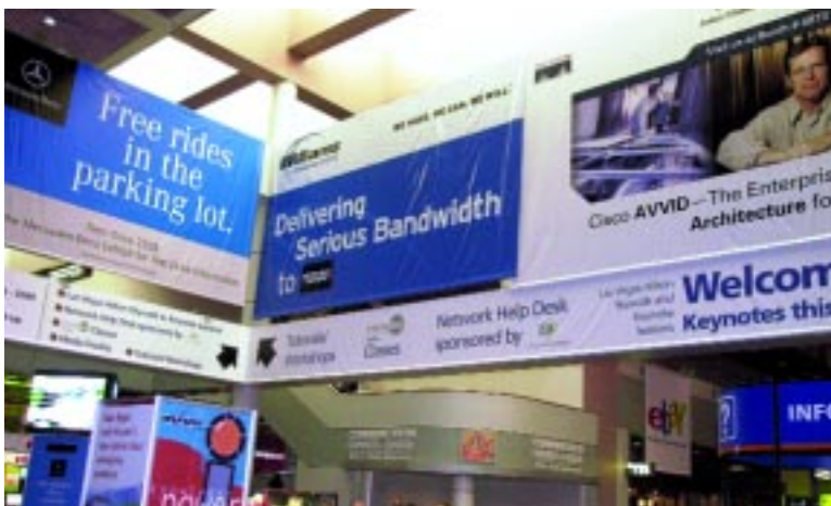
Inside Banners- Grand Lobby