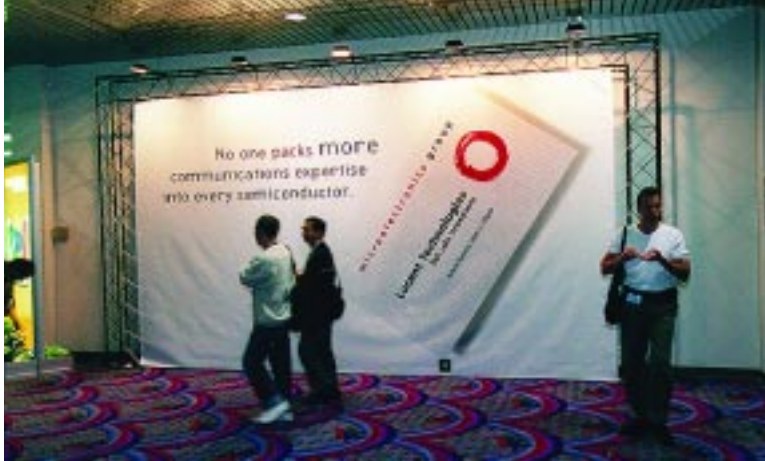
Hanging Banner Against Wall