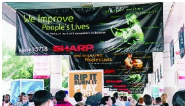
Hanging Banners — Under Bus Pickup Overhang

COMDEX ® THE GLOBAL TECHNOLOGY MARKETPLACE FALL 2003