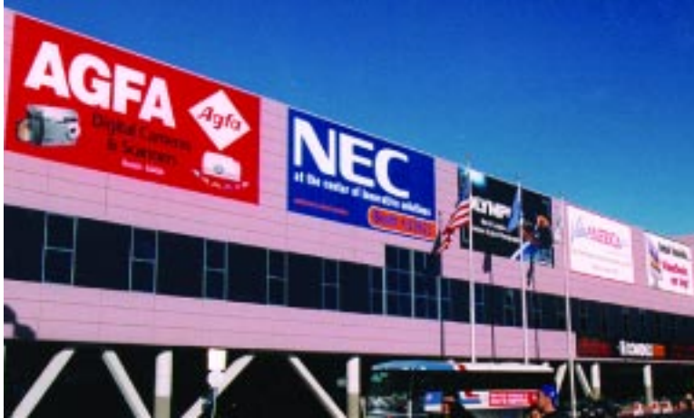
Magnetic Banners — Front Building Facade