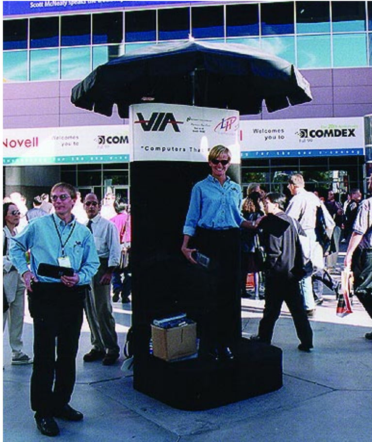
Interactive Kiosk — Front Courtyard

COMDEX ® THE GLOBAL TECHNOLOGY MARKETPLACE FALL 2003