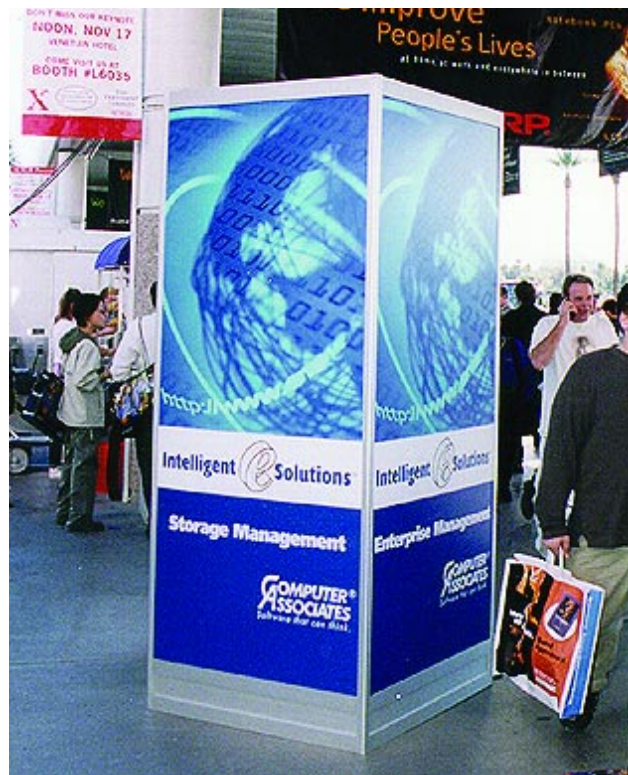
Freestanding Kiosk (Four-Sided)