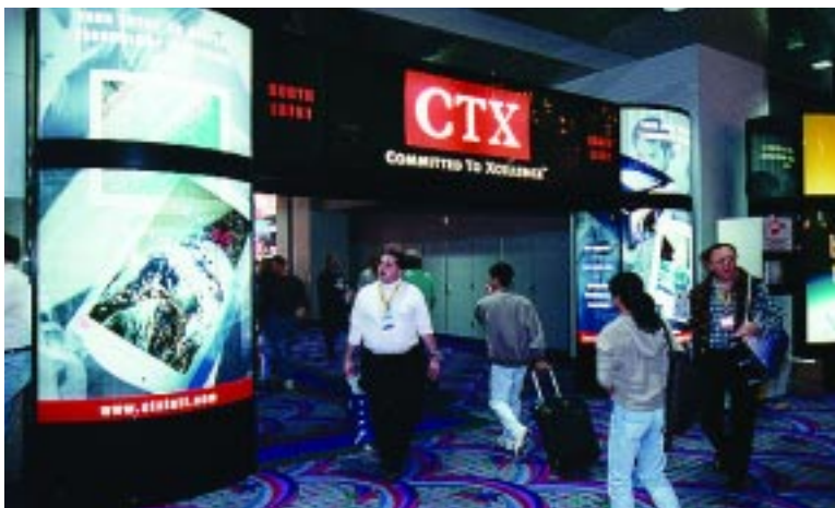
Exhibit Hall Entrance Archway