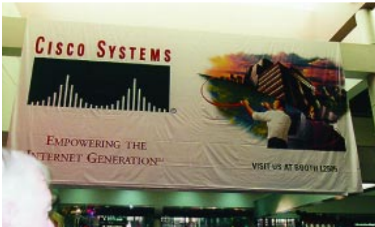
Hanging Banner Over Beam — Main Lobby