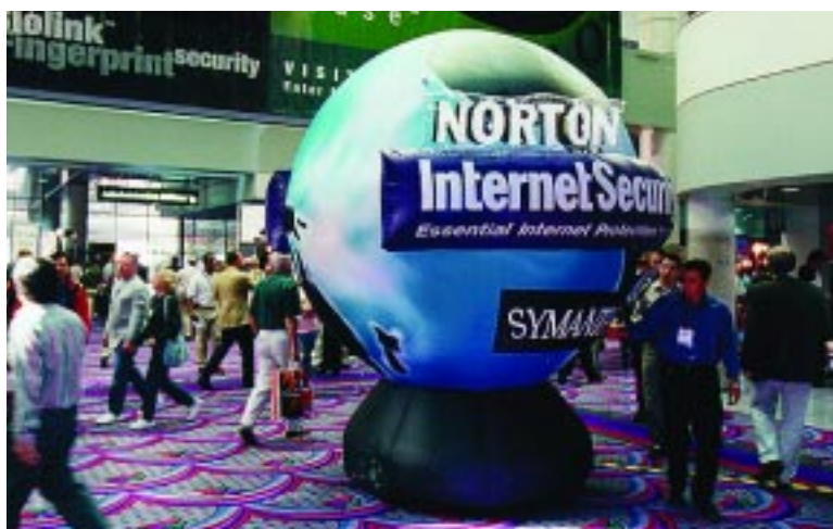
Custom Exposure Zone — Main Lobby