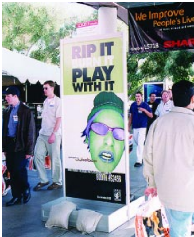
Freestanding Sign (Double-Sided)