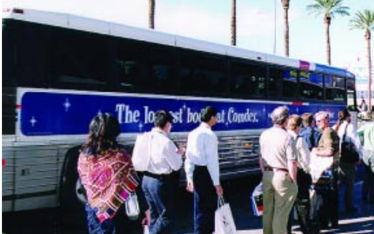
Shuttle Bus Banner