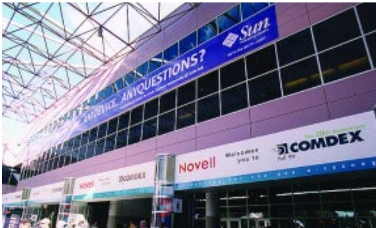
Banner and Entrance Archway — Main Entrance